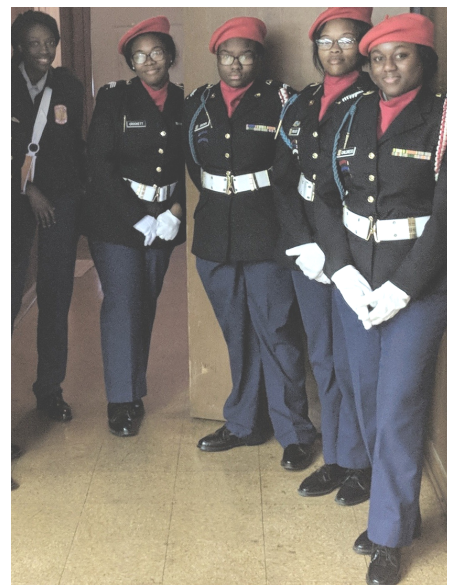
Sumter Central High School JROTC Volunteering and awaiting flag presentation