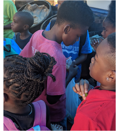
Restaurant Baltar Chef competitor and VI kids get market tour